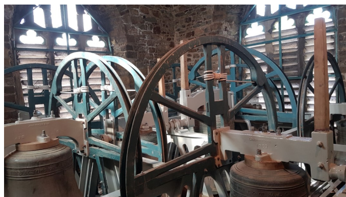
The refurbished bells

In all this work, the most obvious thing has been the cleaning and repainting of the frame. The new bearings and clappers have greatly improved the performance of the bells, but the most important aspect of the work is invisible; the removal of the remnants of the old iron studs that were cast into the bells. Over the years the iron corrodes and, since it is cast into a different metal, it has the potential to crack the bell and cause untold damage. Our bells are now protected from this hazard.