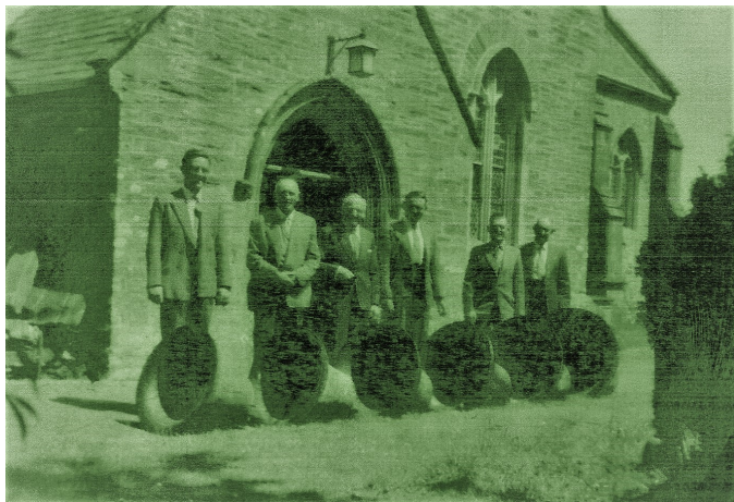
The bells and ringers 1960/61