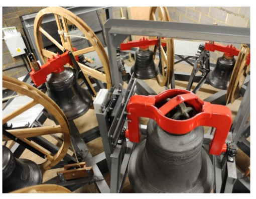
NEW PEAL OF EIGHT IN RADIAL FRAME TOGETHER WITH ELECTRICALLY SWUNG BOURDON AND STATIONARY SERVICE BELL. SOUTH OCKENDON