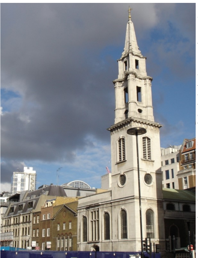
The Church of St Vedast, Foster Lane, London

and succeeded in reaching the Major six-bell Final several times. Amongst these achievements was winning the Ross Shield in the final at Burrington in 1969 and, with some of the other top teams in Devon, competing in an invitation six-bell competition at the Church of St. Vedast Foster Lane, London in 1972. The many ringing certificates on display in the tower at