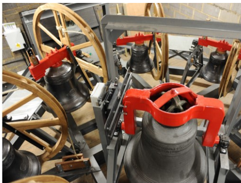
NEW PEAL OF EIGHT IN RADIAL FRAME TOGETHER WITH ELECTRICALLY SWUNG BOURDON AND STATIONARY SERVICE BELL, SOUTH OCKENDON.