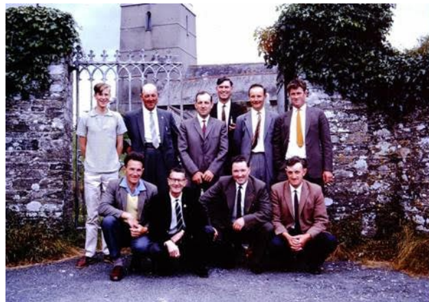
Kentisbeare ringers at Diptford in 1965

The sixties gave way to the seventies and we were ringing as much as ever: especially at competitions. Our neighbouring