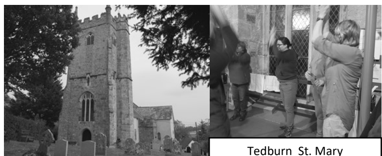
Tedburn St. Mary