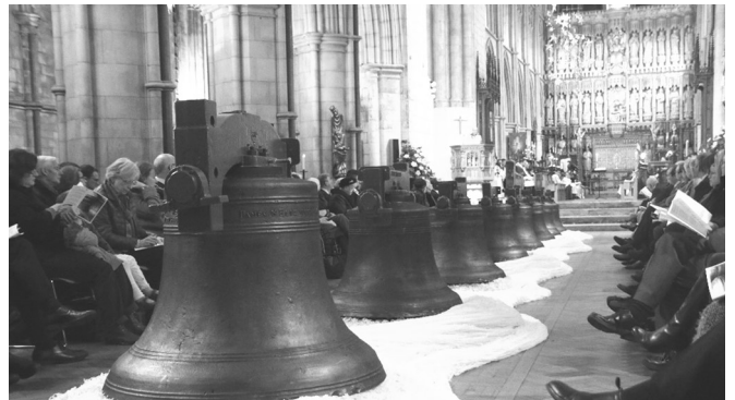
The bells of Southwark Cathedral being rededicated. ‘Since the 14th century, these bells have rung out to call the faithful to prayer.’

But these days the stockbroker who may have bought the Georgian vicarage next door to a church resents its