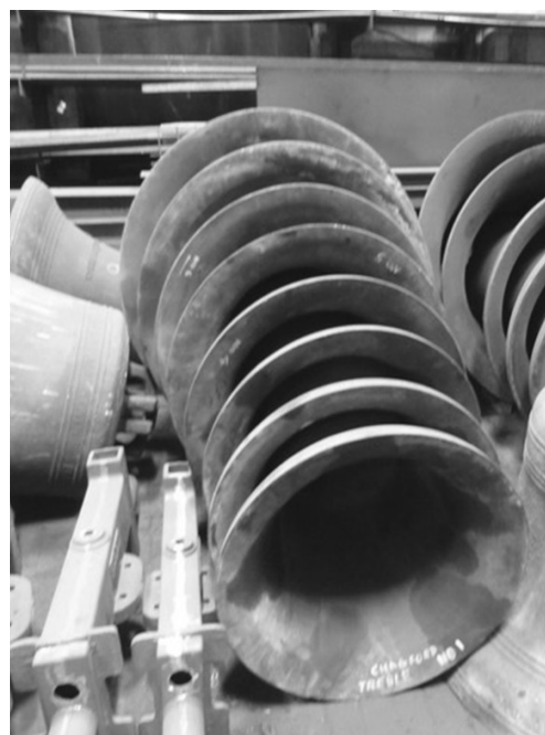
Chagford's bells at Loughborough