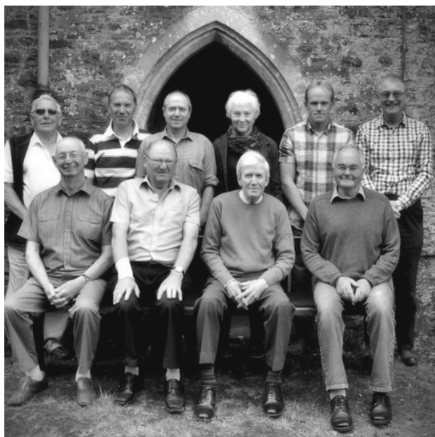
Bishops Tawton ringers