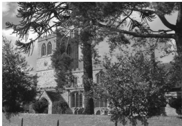
St. Peter & St. Paul, Wingrave